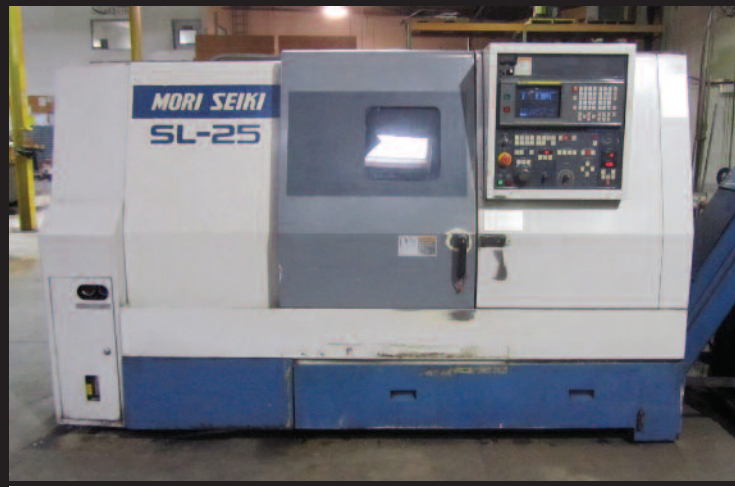
Mori Seiki SL-25B CNC Turning Center, Fanuc 16TA Control, 10" Chuck, New 1993