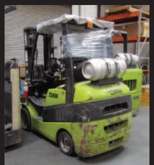
Clark C30CL Forklift