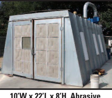
10'W x 22'L x 8'H Abrasive Blast Booth