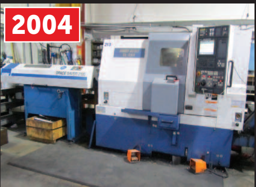
2004 Mori Seiki SL-204SMC, MSG-805 Ctrl., Live Tool, Sub Spindle, S/N 1331, New 2004