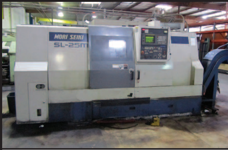
Mori-Seiki SL-25/1000 MC CNC Turning Center, Fanuc 16TA (MF-M6), Live Tool, C-Axis, 40" CC, 10" Chuck, S/N 1211