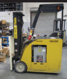
Yale Elect. Stand-Up Lift

TERMS AND CONDITIONS: An 18% Buyer's Premium will be charged on the sale of all assets. The Buyer's Premium will be reduced to 16% for all onsite buyers if payment, in full, is made by means of cash, wire, cashier's check, company check (with bank letter of guarantee) within 48 hours of the close of the sale.