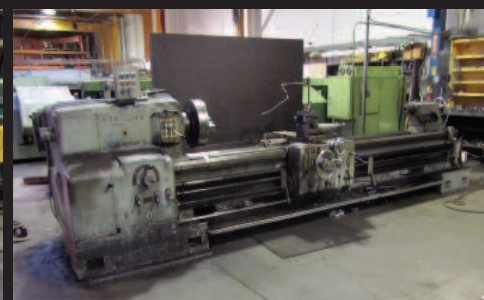
American Pacemaker Style E Engine Lathe

www.machinerynetworkauctions.com | 818.788.2260