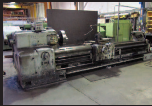
American Pacemaker Style E Engine Lathe