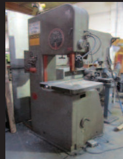
DoAll Vert. Bandsaw