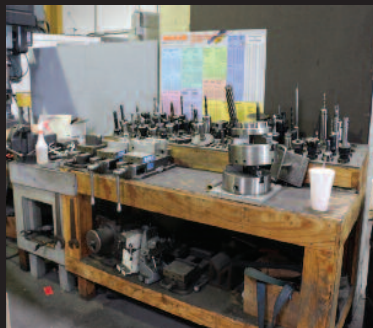
View of Tooling