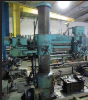
Carlton 3A Radial Drill