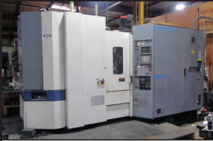
Mori-Seiki SH-50 HMC, MSC-516 Ctrl., Coolant thru Spindle, CT40, 60 ATC, Probe, S/N 588, New 1996