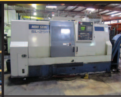
Mori-Seiki SL-25/1000 MC CNC Turning Center