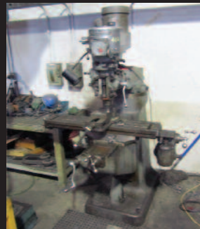
Bridgeport 2J Vert. Mill