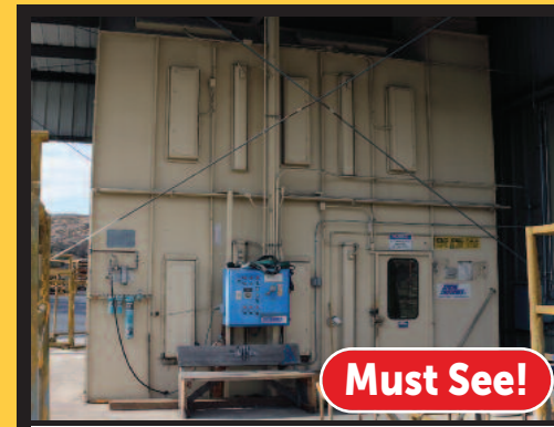
Spray Systems Paint Booth with Filter