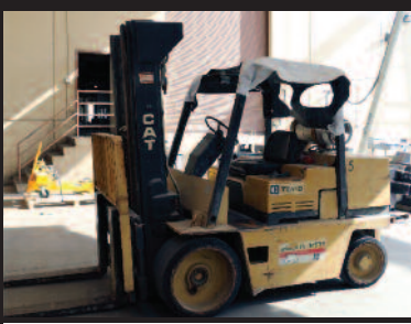
CAT T125D Fork Lift, 12,500 Lb. Cap.