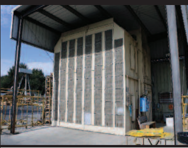
Large Paint Booth

www.machinerynetworkauctions.com | 818.788.2260