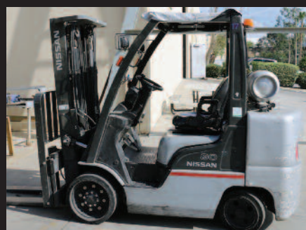
Nissan 80 Fork Lift, 7,000 Lb. Cap., LPG