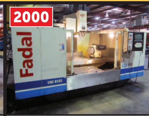
2000 Fadal VMC-6030HT 4-Axis VMC