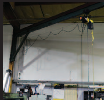
1-Ton Jib Crane