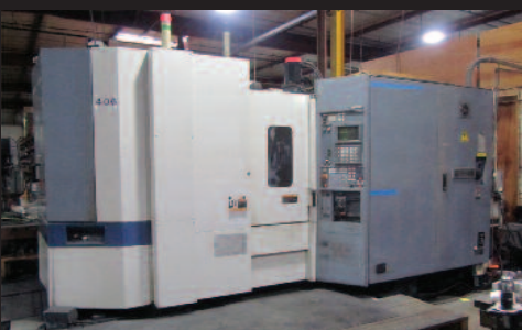
Mori-Seiki SH-50 HMC