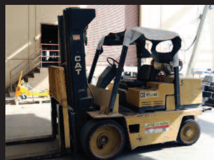
CAT T125D Fork Lift, 12,500 Lb. Cap., LPG