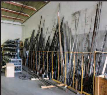
View of Stock Materials